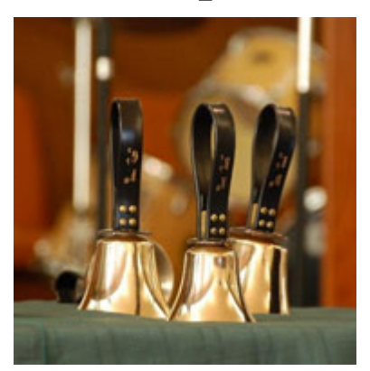
First Presbyterian Church 3940 27 ½ Road, Grand Junction