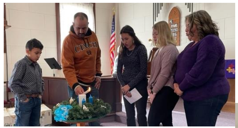
The Yanez Family lights the Candle of Hope