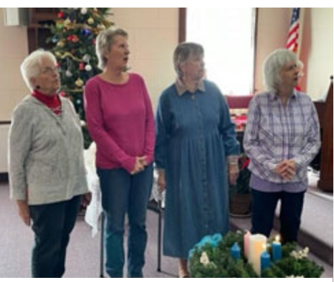
Stewards light the Candle of Peace